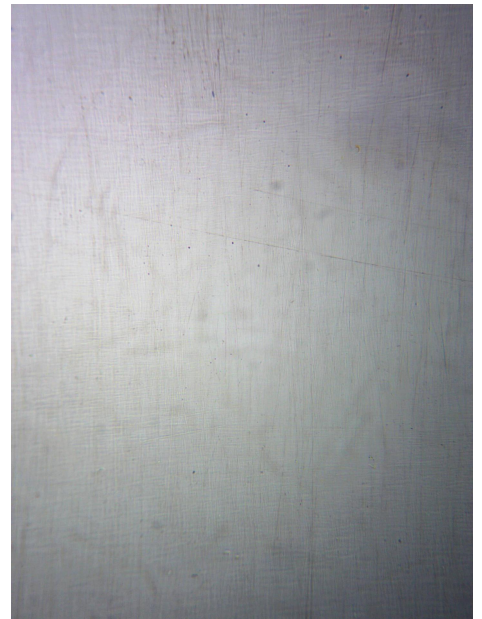
X100 Non-metallic Inclusions