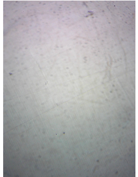
X100 nonmetallic inclusion